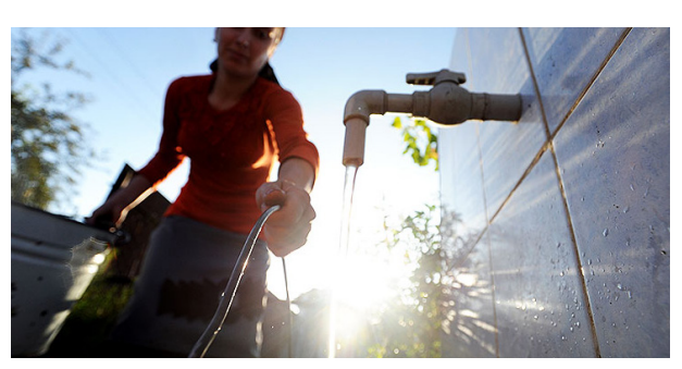
Consuming huge amounts of cleaning media