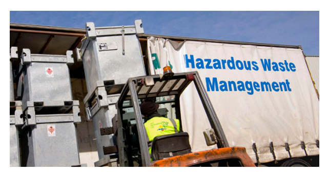
Insane waste disposal bills from container and tank cleaning